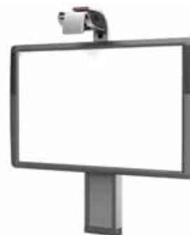
ActivBoard 300 Adjustable with EST-P1 projector