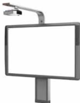
ActivBoard 300 Adjustable with PRM-30a or PRM-35 projector